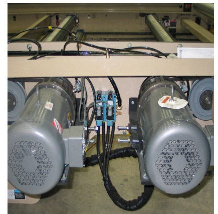
Dual capstan motors after upgrade

Contact your MarquipWardUnited Aftermarket Sales Team for more information at (715) 339-2191.