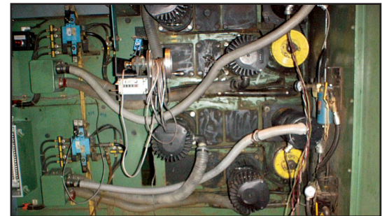
Older Brush-Type Motors