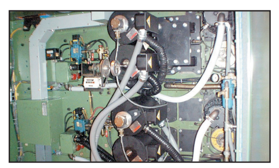
Brushless Motors After Upgrade