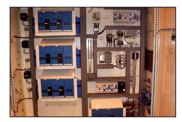
CAUTION: Before working on machine, perform lock-out procedure per Manual Operation Section.