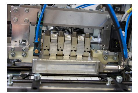
PUR gluing nozzle