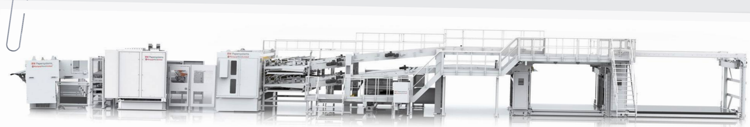
Performance Dry End

The Performance Corrugator offers maximum production and board quality. This line features the Sentinel, a complete